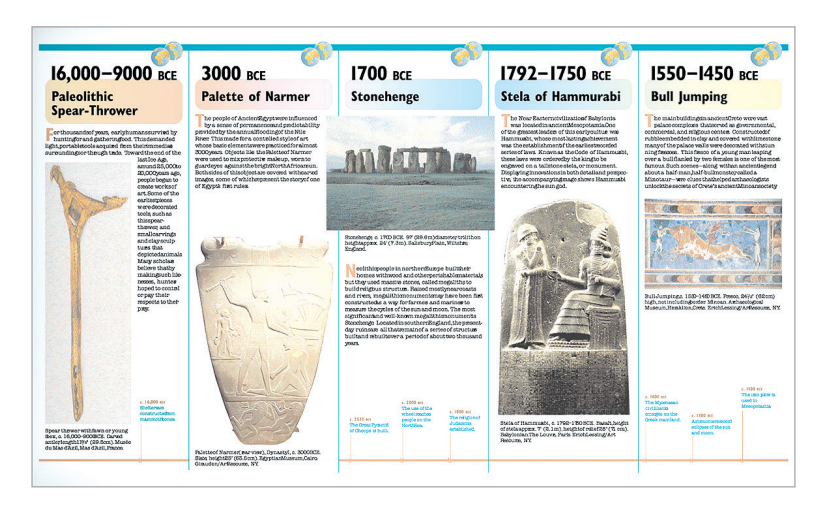
History Through Art Timeline