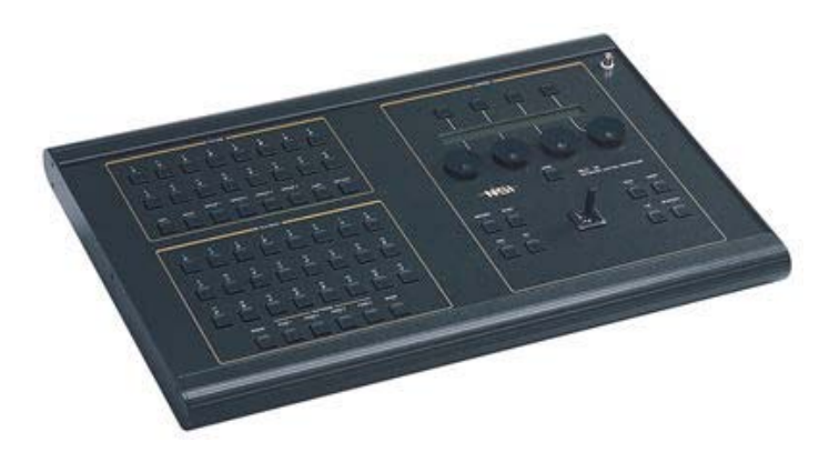
MLC-16 Moving Light Control Console

Moving Light Console : This is a computer controlled console specifically designed to control automate, intelligent lights such as moving heads and moving mirror lights. They have large libraries of different brands and model number lights pre-programmed in, and have joysticks, sliders, rotary knobs, and buttons to facilitate setting pan/tilt position, color, pattern (gobo), and other effects, then remember those settings in a string of memories called a sequence. These consoles are complex and require a significant learning curve for beginners. Popular brand names are "MLC-16", HOG, "Light Jockey", and the generic term DMX controller.