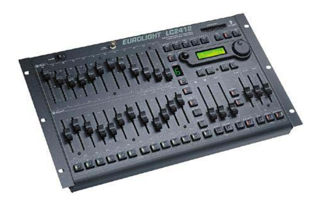
Manual 2-Scene Preset Control Console

Manual 2-Secen Preset : this most basic and useful lighting console consists of two identical rows of dimming sliders, plus a crossfader and master control. The identical rows of sliders are typically arranged so each slider controls one dimmer, and thus one or two lights. The top row of sliders is usually set for the first scene in a play, and the bottom row of sliders is set for the second scent. The crossfader control is arranged to allow switching between the two rows, and hence the two scenes. These consoles are very easy for beginners to operate, even though there seems to be so many different sliders. Despite the inclusion of the term "manual" in this description, many are computer controlled and can remember complex settings in a step-by-step way.