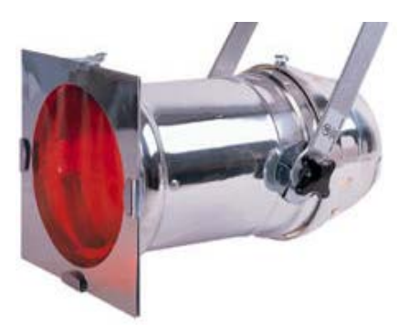
Gel in gelframe on a Par Can