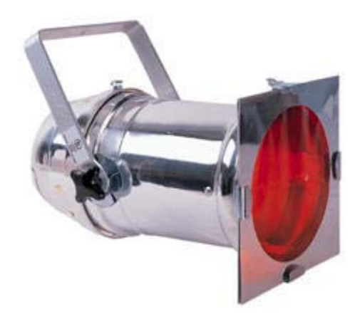
Par Can with colored gel

The quality of the light beam is totally contained as part of the PAR lamp. Available in Very Narrow (VNSP), Narrow (NSP), Medium (MFL), and Wide (WFL), the beam shape is determined by the reflector and front glass design, so you buy the lamp in the beam type you need. The pool of light produced has soft focused edges, so it's easy to blend the lights. The beam/spot shape is oval shaped, so you get some shape control by rotating the lamp in the can housing. The brightness is based on the rated wattage. Standard wattages are: 300W, 500W, and 1000W. Very Narrow Spots (also called Pin Spots) for illuminating mirror balls, etc. are typically only 36W. In addition to brightness, beam shape, and wattage, the lamps and cans are available in different sizes, based on diameter. The most common standard sizes are: Par36 (4.5"), Par 46 (5.75"), Par 56 (7"), and Par 64 (8"). Par36 and Par46 are for narrow beam pin spots. Par56 and Par64 are the workhorse lights for rock, small stages, and general illumination. Par56 is most often found in 300W, and Par64 will most often be 500W or 1000W.