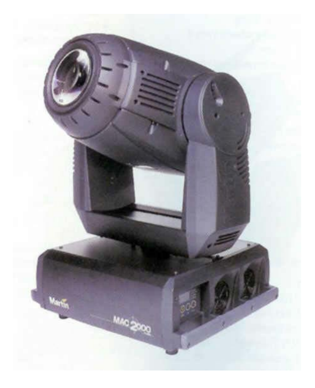
MAC 2000 Moving Head

A moving head lighting fixture is a modern, computer controlled light in the category of "intelligent lighting". This class of lighting fixture is most often used in music and rock shows, but is also being used more and more for classical theatre. Popular names for these lights include "MAC", "Studio Spot", "VariLite", and moving yokes. These lights do it all – they move in pan (horizontal) and tilt (up/down), they change colors, and they can change patterns. The most complex versions of these lights also have motorized focus, multi-pattern prisms, strobes, and built-in complex programming effects. These lights are generally fragile and should not be handled roughly. They are expensive to buy and expensive to fix. These lights need computerized consoles to operate, and they are NEVER to be plugged into a conventional theatre dimmer, even if it's set on 10 all the time. Extensive training is needed to understand how to handle, program, and properly use these lights, but the razzle-dazzle effects are well worth the added care required!