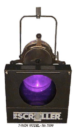
Color Scroller mounted on an ellipsoidal spotlight

This is a lighting accessory that has 12 or more different colored "gels" taped together into a single scroll, also called a "gel string". Using the DMX lighting computer commands, the scroller has motors that move the gel string to the desired color. Color scrollers are often mounted to ellipsoidal lights, fresnels, and par cans.