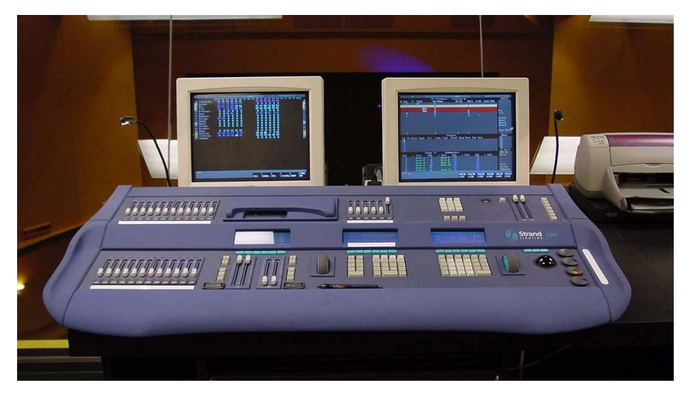
Modern Computerized Lighting Console

The lighting console is the operations control center of any lighting rig. Consoles vary in how many different dimmers they can control, whether they are manual or computer controlled (automated), and how well they control intelligent lighting. There are generally three types: manual 2-scene preset, moving light console, and fully automated computerized console.