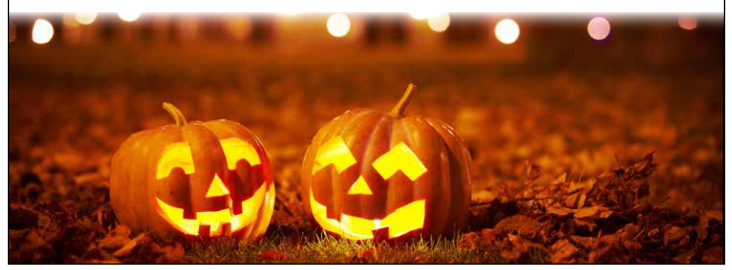
Super Teacher Worksheets - www.superteacherworksheets.com

so now ala this tradition evolve this carving pumpkins for Halloween? when millions of Irish people immigrated to America after the Irish potato famine, they had trouble finding potatoes and turnips. They began to use pumpkins, which were more abundant and easier to carve. Today, this Irish tradition is a large part of the American celebration of Halloween.