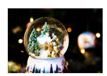
What / the hardest thing this year?