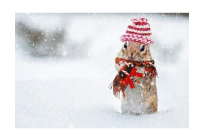
What / want to learn in 2018?