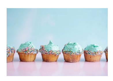
What / want to get better at?